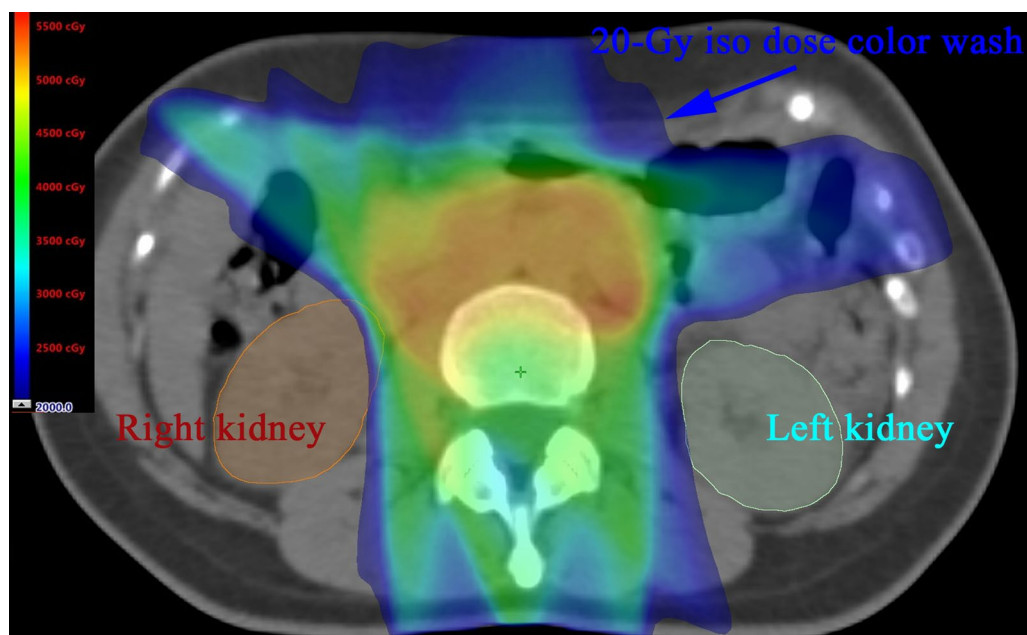
Fig. 1 Example axial images showing the isodose distributions for the EF-IMRT plans of a representative patient. The volume percentage was 1.9% for both kidneys that received 20 Gy and there was no renal dysfunction. The parts of the right (brown line) and left (cyan line) kidneys excluded from the 20-Gy isodose color wash (blue) are shown

To examine factors confounding the renal function reduction results, we compared EFRT patients with and