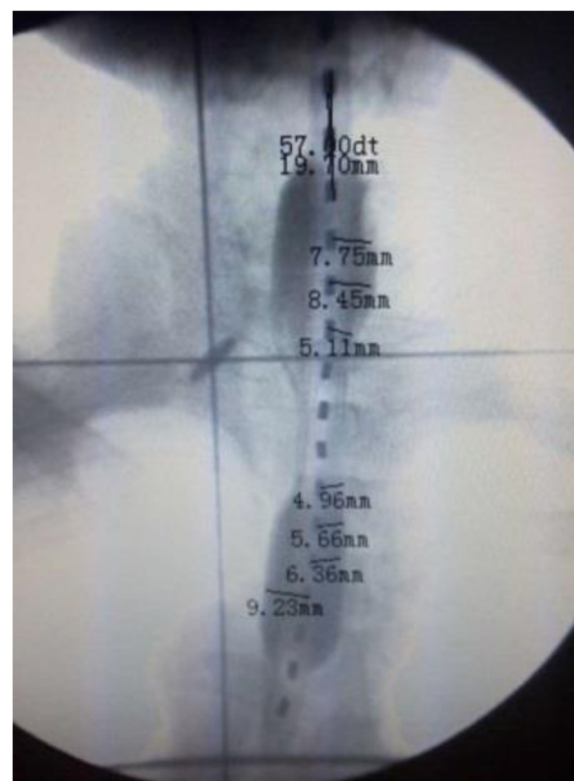
Fig. 1 The x-ray image showing the tumor regression conditions before each of the 2–5 treatment fractions of NBT

source close to the tumor but away from the adjacent normal epithelium. Figure 1 is an x-ray image taken while the applicator and a dummy source were both inserted into the esophagus of a patient. The water balloon can clearly be seen as it is filled with an x-ray contrast agent. The position of the source capsule was then determined (based on the x-ray image) and input into the treatment planning system. The radiation dose was prescribed to the reference point, which was located 10 mm from the center point of the source capsule in the transverse direction. The physical characteristics of neutrons and gamma rays emitted from ^{252}\text{Cf} , the characteristics of the applicator and the process of NBT, and the method converting absorbed neutron dose (in Gy) to the equivalent gamma-ray dose (in Gy-eq) were described in detail by Liu et al. [4]. Specifically, the neutron RBE value varies from 2.9 (for the new source) to 4.3 (for the 10-year-old source), and it was calculated based on an algebraic formula included in the treatment planning system. The treatment time for each fraction varies from a few minutes (for the new source) to about an hour (for the 10-year-old source). The total dose received by each patient via NBT varies between 8 and 25 Gy-eq, which were delivered in two to five treatment fractions, with 4–5 Gy-eq per fraction per week.