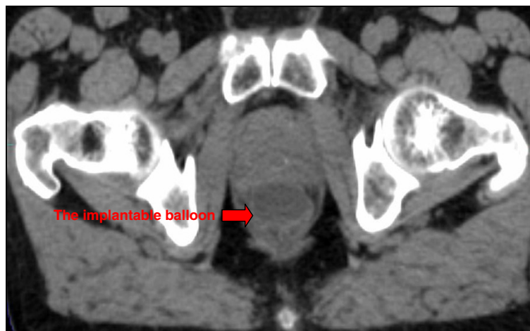
Figure 1 Axial view of CT scan, 7 days post balloon implant.

Geometric analysis: The average prostate-rectum distance increased from 0.22 ± 0.2 cm before implant to 2.47 ± 0.47 cm after the implant. The average distance reduced to 2.41 ± 0.43 cm at the end of radiotherapy (statistically non significant). The balloon dimensions 7 days post-implant and at the end of radiotherapy were as follows: width 3.06 ± 0.27 cm and 2.96 ± 0.25 cm (p = 0.03);