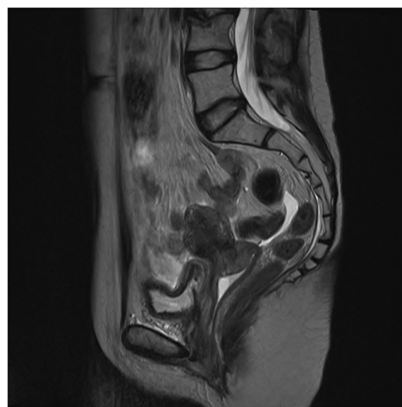
Figure 1 Patient #1: MRI at time of cervical necrosis (January 2009).