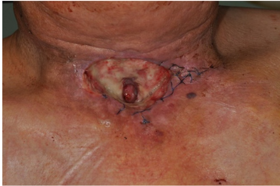
Figure 1 Clinical case of a 55-year-old male, six months after primary radiochemotherapy due to an advanced squamous cell carcinoma of the hypopharynx. Skin atrophy and soft tissue necrosis were observed 8 weeks after the completion of therapy.

(FGF) and platelet-derived growth factor (PDGF) [12]. Nitric oxide (NO) promotes wound healing by an induction of collagen deposition [16]. NO levels have been reduced in irradiated wounds of experimental animals [17]. This finding may explain the impaired strength of irradiated wounds.