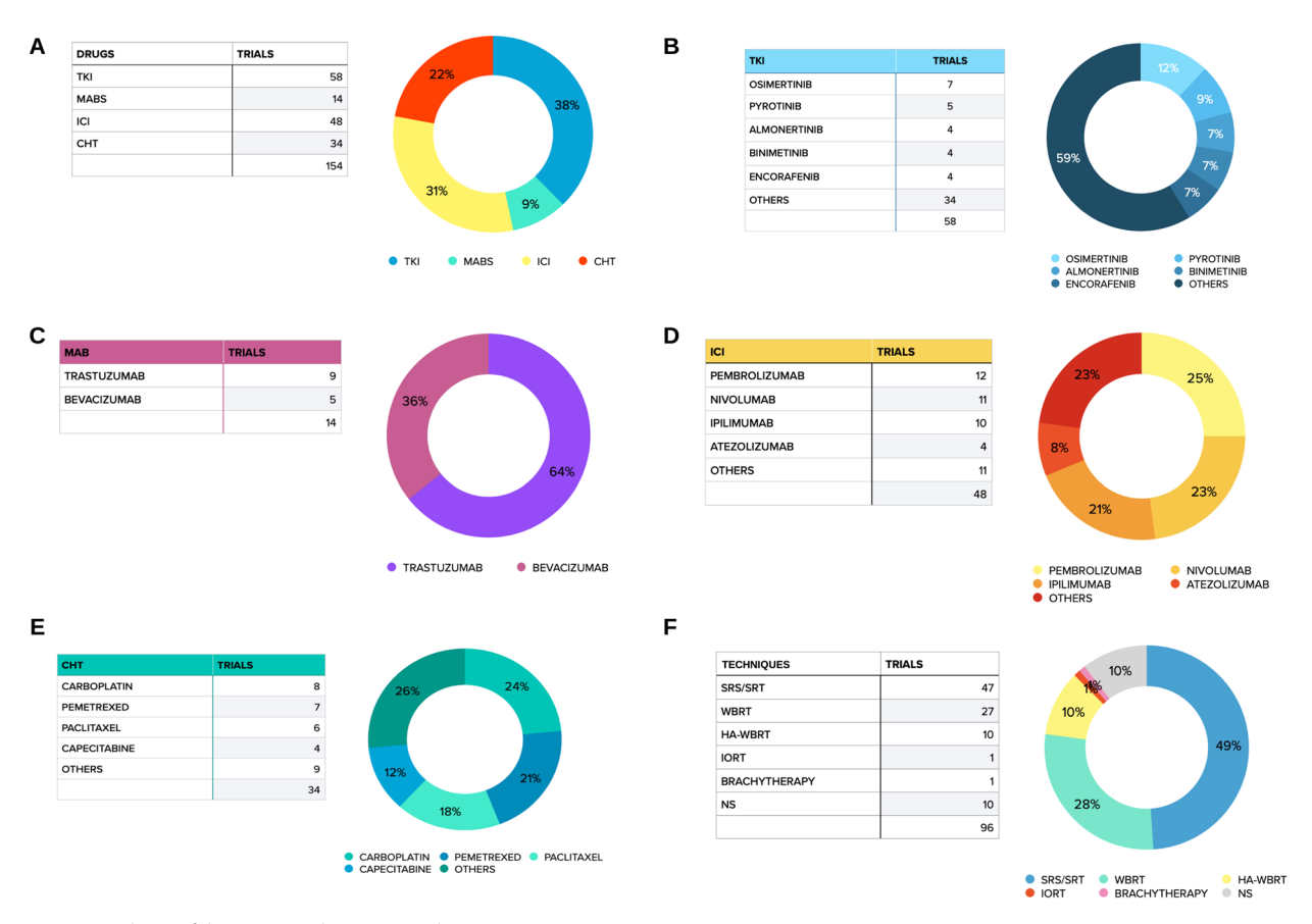
Fig. 2 Pie charts of the systemic therapies used

varies per patient and should involve multidisciplinary discussion as well as patient-centered decision making focusing on maximizing tumor control and minimizing toxicity and improving the quality of life of patient [26]. In this regard, the Diagnosis-Specific Graded Prognostic Assessment (DS-GPA) is a valid prognostic score that might improve shared decision making in clinical practice as well as patient stratification in prospective clinical trials [27].