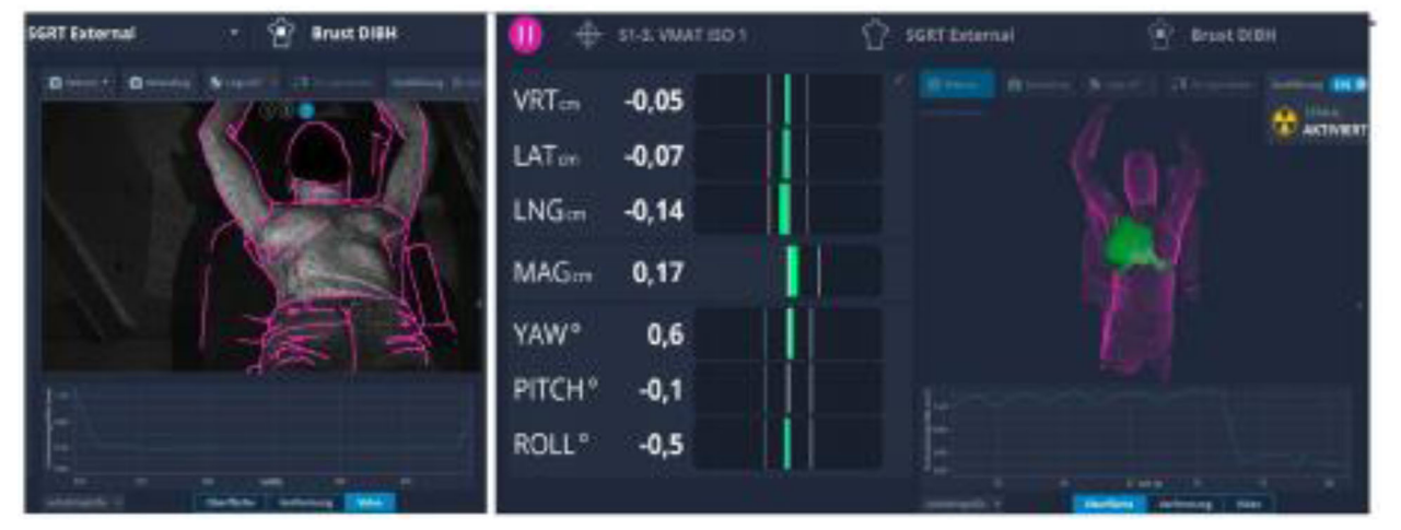
Fig. 3 Positioning of a DIBH patient. Left: Positioning of the patient using the reference surface (purple) and the live surface data. Right: Monitoring of the DIBH during treatment on a highlighted (green) ROI. The breathing curve is depicted on the bottom.