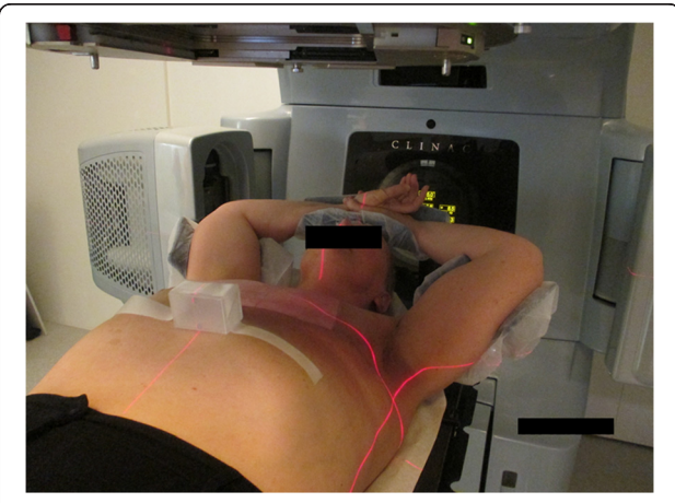
Figure 1 Patient fixation. The breast board is tilted by 5° and it has two arm support devices. The patient lies supine with both arms lifted above the head. The RPM marker block is taped to patient skin. The laser lines are aligned to three tattoo marks placed in free breathing on patient skin: two marks on both lateral sides and one on the sternum. There is also one mark on the abdomen to minimize patient rotation. After the laser alignment, translational shifts are performed to the treatment isocenter before the image quidance procedure.

A total of 67 consecutive left-sided breast cancer patients receiving adjuvant RT following breast conserving surgery were retrospectively investigated using offline analysis. Of these, 23 patients were treated for axillary and supraclavicular regions due to lymph node involvement. The mean patient age was 55 years. Patient fixation was carried out with Candor's ConBine fixation device (Candor, Gisley, Denmark) (Figure 1). A Varian RPM respiratory gating system, version 1.7 (Varian Medical Systems, Palo Alto, CA, USA) was used for respiratory monitoring. An RPM block with two dot markers was placed between the xyphoid process and the umbilicus (4.5 cm below the xyphoid on average, as previously reported [1,9]) to detect maximal anterior-posterior respiratory movement. Each patient was carefully informed about the breath-hold procedure. Before the planning CT, patients were audio coached to perform reproducible and stable breath-holds for periods of 12-15 s at least 4-5 times and one breath-hold exceeding 20 s. If these conditions were met, a gating window from ±2 to ±5 mm was set around the average BHL. The window width was chosen based on the upper and