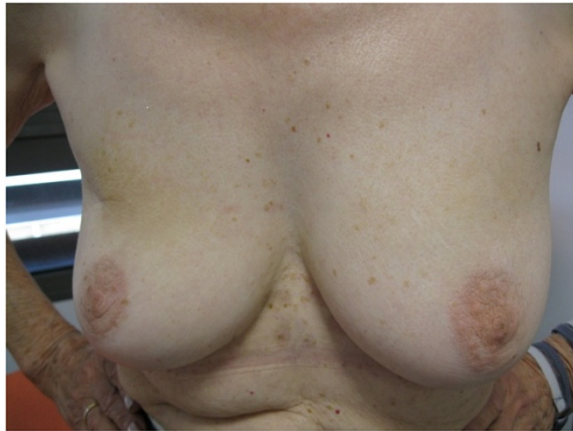
Figure 2 Photographies of patient #1 with 60 months of follow-up.

The fourth local event was a second 3-mm primary ductal carcinoma located in another quadrant and diagnosed 3 months after the surgery. The RADELEC scientific committee considered this event as a second primary tumor omitted during the preoperative staging (staged only by ultrasound).