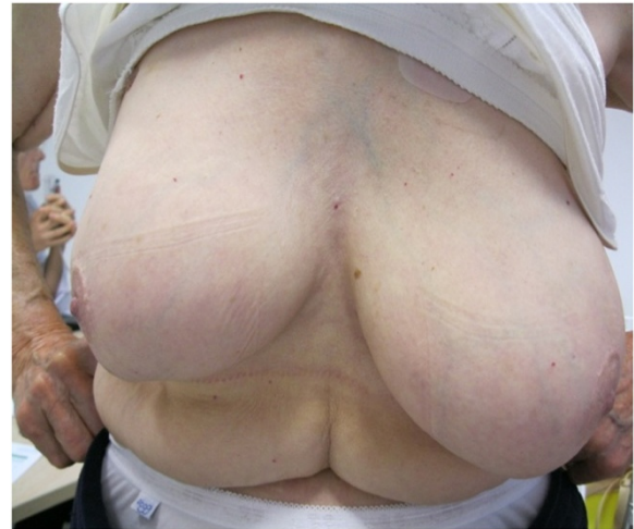
Figure 4 Photographies of patient #3 with 60 months of follow-up.

patients (40%). These structural changes in the tumor bed complicated the evaluation of mammograms within the first two years of follow-up. Two patients required non-routine procedures leading to a biopsy for pathological control. Both of them had outside institution exams.