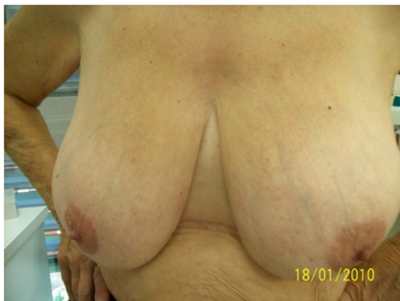
Figure 3 Photographies of patient #2 with 60 months of follow-up.

Post-treatment mammograms showed characteristic pictures of severe cytosteatonecrosis in 30 patients (71%) corresponding to a palpable mass within the IORT area for 17