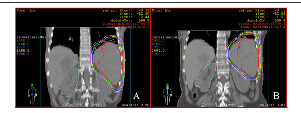
Figure 2 Transaxial slices representative of isodose distribution of 3D-CRT treatment plan delivered for the whole spleen. A , In the first stage, isodose curves were produced by 3 oblique isocentric photon fields of beam quality 10-MV; B , In the second stage, isodose curves were produced by 5 oblique isocentric photon fields of beam quality 10-MV.

Here, our patient refused to take chemotherapy or splenectomy, so she was treated with splenic re-irradiation for WM progression. She tolerated the treatment of 3D-CRT up to 24 Gy well. With overall doses between 4 and 10 Gy in mostly 1-Gy fractions, symptoms of splenomegaly have been improved in 50-87% of chronic lymphatic leukaemias patients [5]. Although lower dose per fraction and lower total dose radiation have been a standard in the treatment of hematological and myeloproliferative-associated splenomegaly, we advocate higher doses for sustained remission used to patients with WM, especially those who cannot tolerate operation and chemotharapy. SI may remain practicable for the elderly patients, even with total dose of 20 Gy [10]. Re-irradiation for further symptomatic progression is also carried out in other diseases. It was regarded that splenic re-irradiation was feasible without excessive toxicity. We think that our patient can tolerate re-irradiation up to 24 Gy well, partly because of the use of 3D-CRT. The common technique of SI is two parallel opposing anterior-posterior portals encompassing the whole spleen. The use of 3D-CRT is especially beneficial for patients treated with re-irradiation or patients with impaired renal function.