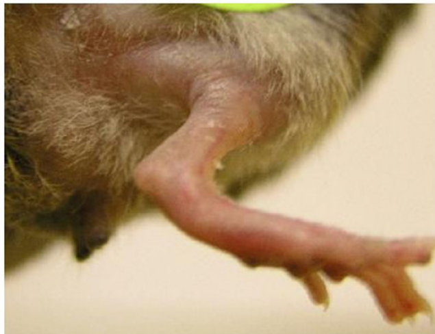
Figure 3 Photograph of representative irradiated leg of TSK mice showing minor damage 110 days post-irradiation compared to parental control. The TSK mice had relatively normal legs (panel B) post-irradiation except for hair loss whereas parental control mice (panel A) showed extensive skin and leg injuries following the radiation exposure.