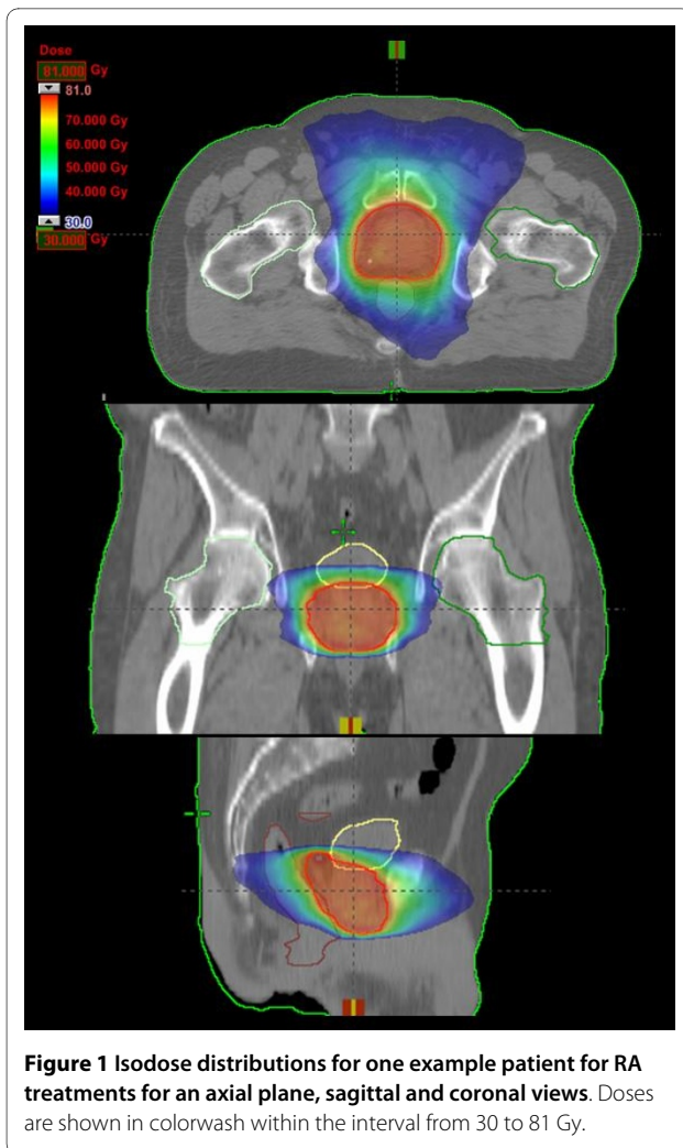
Figure 1 Isodose distributions for one example patient for RA treatments for an axial plane, sagittal and coronal views. Doses are shown in colorwash within the interval from 30 to 81 Gy.

and single arcs, gantry speed is kept constant at maximum speed.