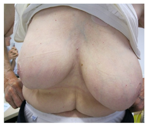
Figure 4 Photographies of patient #3 with 60 months of follow-up.

Post-treatment mammograms showed characteristic pictures of severe cytosteatonecrosis in 30 patients (71%) corresponding to a palpable mass within the IORT area for 17