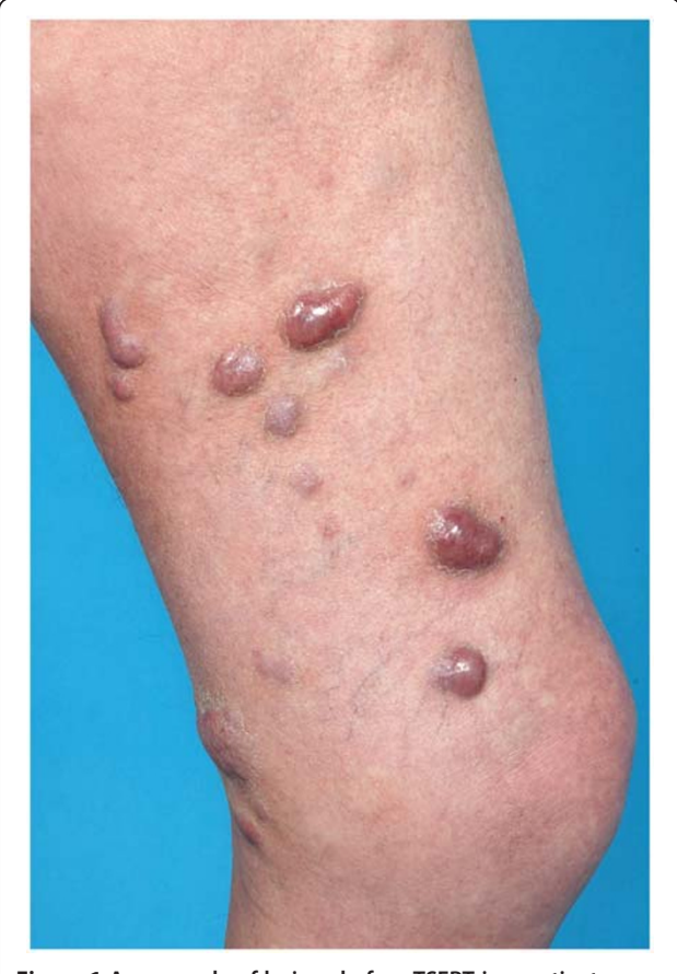
Figure 1 An example of lesions before TSEBT in a patient suffering from stage IIB CL.

The median follow-up time was 10 months (range 1-46 months). Treatment response regarding palliation with symptom relief, especially of pruritus and regression of cutaneous lesions, was achieved in 23 patients (92%). A clinical complete response was documented in 13 (52%) and a partial response in 10 patients (40%). The median time to skin progression was 5 months (range 1-18 months) and the actuarial six-months and one-year skin-progression-free survival were 55% and 35%, respectively (Figure 3). There were no statistically significant differences (p = 0.076) in PFS between CTCL (mean PFS 8.4 months, 95% CI 5.3-11.5 months), CBCL (mean PFS 3.0 months, 95% CI 1.8-4.1 months) and leukemia (mean PFS 13.5 months, 95% CI 10.6-16.4 months). The median overall survival after the initiation of TSEBT was 10 months (range 1–46 months; Figure 4). The actuarial one-, two- and three-year OS were 45%, 20% and 7%,